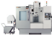
4 off XYZ 1060