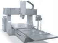
XYZ BRM Bridgemill