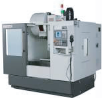
XYZ VMC 710