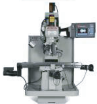
XYZ SMX 2500