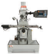
2 off XYZ SMX 2000