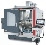
XYZ UMC-5X 5 axis